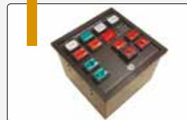
Tow Pin Bridge Control Panel