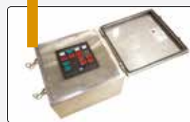
Tow Pin Local Control Box