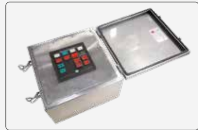
Tow pin local control box