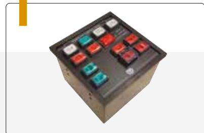
Tow pin bridge control panel