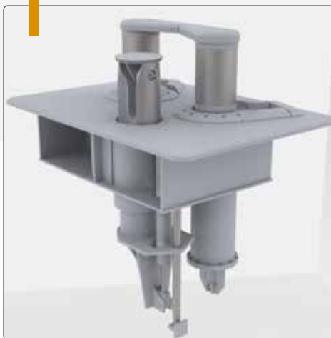
DTP 14 SZH Tow pin with fork