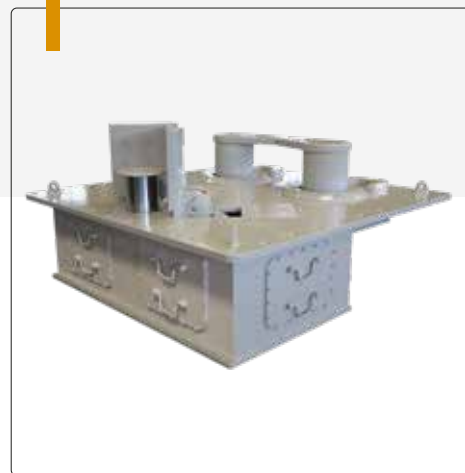
DTP 10 SJH Tow pin with shark jaw