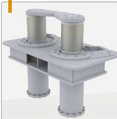
DTP 12 SH Tow pin